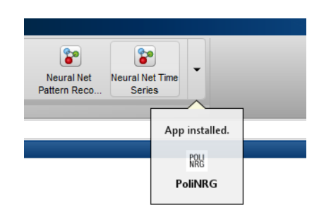
Figure 1: PoliNRG installation procedure

When you open PoliNRG the GUI showed in Figure 2 should appear on your screen. You can find many information buttons that can indicate you how to fill correctly the forms. Before running your own case study, we suggest you to open one already created. To do this, click on the open button and open the file called NRG_Input_Tanzania that you can find in the folder CaseStudy_Tanzania . Explore all the tabs, you can see that five scenarios have been considered for